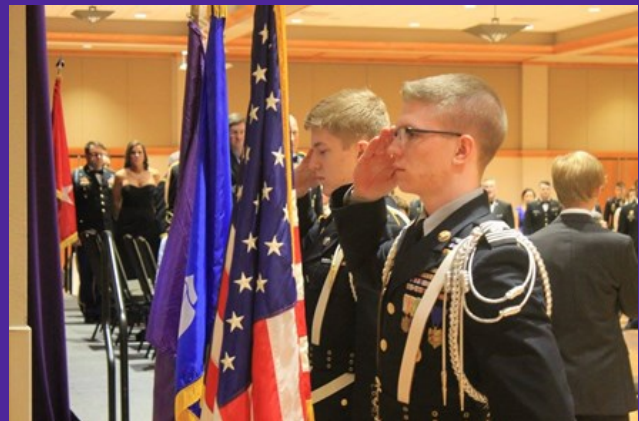
Waterloo East High School JROTC Color Guard at the Panther Battalion's 2016 Military Ball