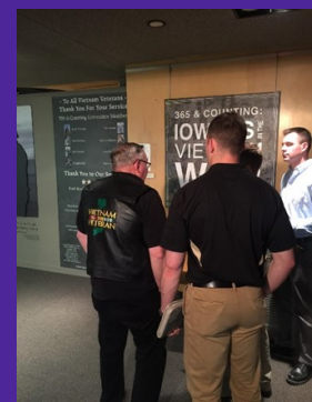
Vietnam Veterans Panel Discussion and tour of the Sullivan Brothers Iowa Veterans Museum