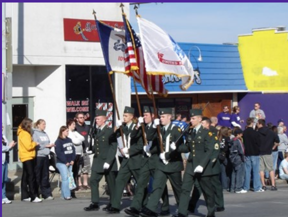
ROTC Color Guard Leading the Homecoming Parade, 2007

UNI ROTC celebrated its 30 th birthday as a host program this year along with the 100 th anniversary of Army ROTC. The main celebration took place at the Panther Battalion's Military Ball which was held on February 27 in the Maucker Student Union Ball Room. 188 cadets, cadre, alumni, and supporters attended the event. In 1986, the Panther Battalion split off from the University of Iowa ROTC program to establish its own Cadet Battalion. The program has commissioned 498 officers for the active Army, Army Reserve, and Army National Guard. The Panther Battalion also hosted a fun run on April 23 to celebrate a century of ROTC producing officers. 50 cadets from UNI ROTC, Waterloo East High School Junior ROTC, and Waterloo West High School Air Force Junior ROTC completed the 5-kilometer fun run.