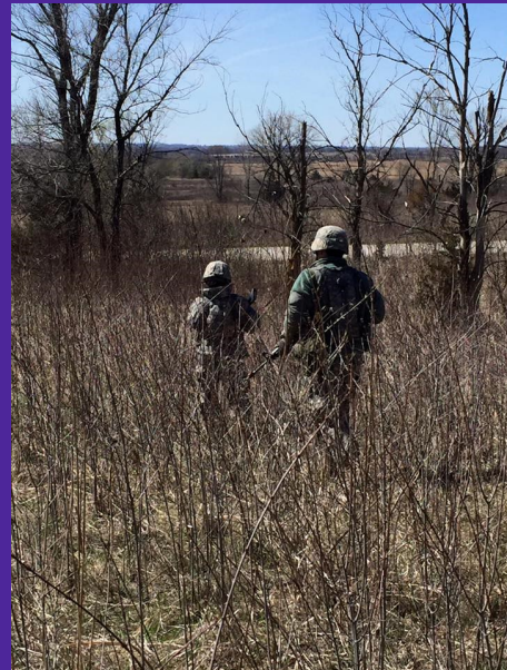
Field Training at Camp Dodge during the TF Dodge CLDX