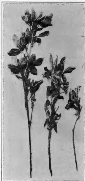
Fig. 2. Peronospora trifoliorum on alfalfa showing systemic infection developed in terminal shoots and profuse conidial development. This type of infection frequently leads to dwarfing. An uninfected branch is shown at the left.

This species of Peronospora was easily cultured in the greenhouse on alfalfa seedlings. Stock cultures were maintained in thickly seeded eight-inch pots. The incubation pe-