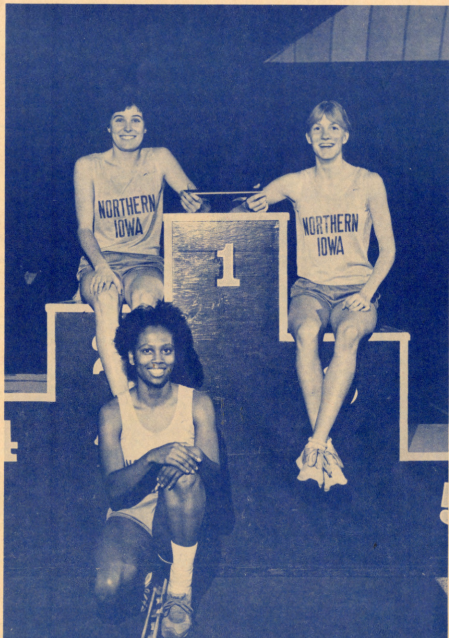
1983 Northern Iowa Women's Track & Field Indoor & Outdoor