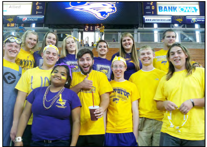
LLC biology students attend UNI events together.

history of bats and the process of echolocation.