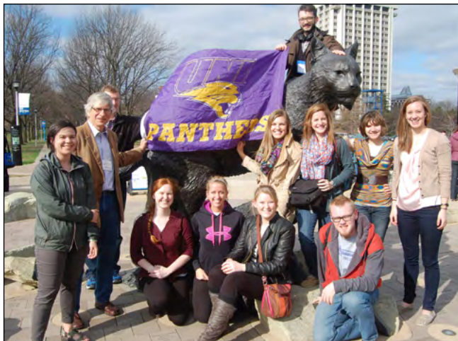
UNI students pose at Kentucky Wildcat statue where they attended the 2014 NCUR Conference.

On April 3-5, 2014, seven biology majors who have been involved in undergraduate research took their findings to present at the annual meeting of the National Conference on Undergraduate Research (NCUR). This meeting is hosted at a different site each year and provides a collegial and stimulating venue for students from across academic disciplines and across the nation to share their findings. The University of Kentucky in Lexington hosted the 2014 meeting. In all, sixteen UNI students together with five