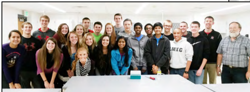
Three classes from Linn-Mar High School learn about DNA analysis procedures.