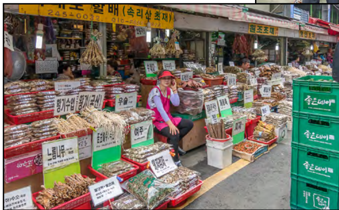
Above are the class members from the Natural World class taught in Korea. Left is the marketplace near the school.

southern coast of the country. This is a favorite spot for South Koreans to visit. UNI is working to strengthen ties with South Korea’s universities, and this was the first time that KNU welcomed a visiting professor from UNI.