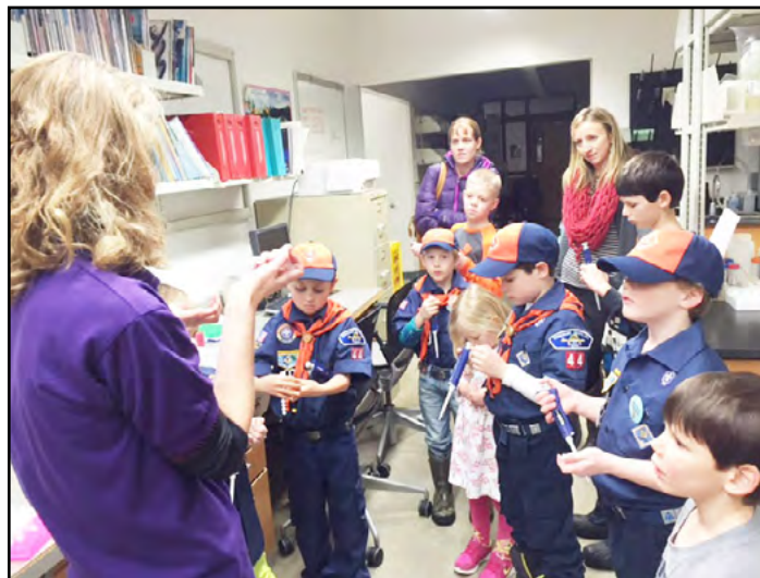
The Tiger Cubs from Hansen Elementary visit the Department of Biology.