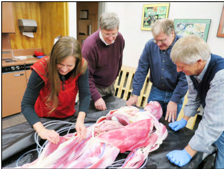
Four SynDavers were purchased for use in Anatomy and Physiology

B iology students in our Anatomy and Physiology I course will soon be living the dream - dissecting cadavers.