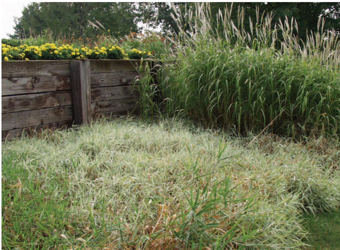
Elmcrest Country Club