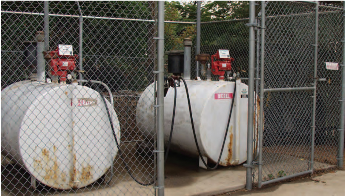
Fuel Storage Tanks

Golf courses typically have aboveground and/or underground fuel storage tanks on site. Title 40, Section 112 of the Code of Federal Regulations (CFR) requires a Spill Prevention Control and Countermeasure (SPCC) plan for facilities with total aboveground petroleum product storage (i.e., new oil, used oil and fuel) capacity in excess of 1,320 gallons. SPCC plans are designed to minimize the potential for a petroleum release to occur and mitigate any environmental impacts in the event one does occur. The SPCC regulations generally require secondary containment for filling and dispensing operations. However, alternatives (i.e., contingency plans) are allowed if such containment is impractical. Contact the IWRC for assistance in obtaining an SPCC at 1-319-273-8905.