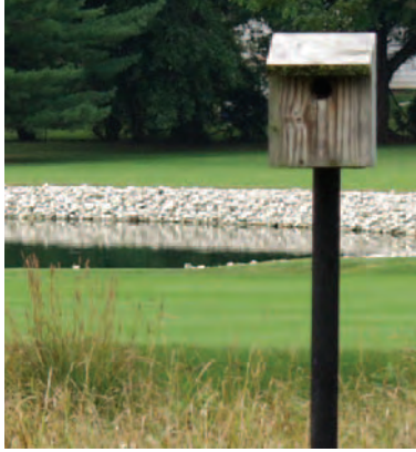
Bird House - Elmcrest Country Club