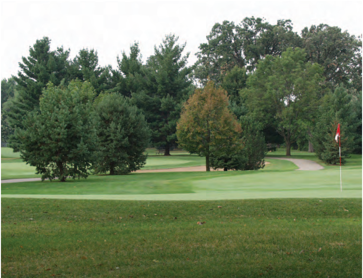
Elmcrest Country Club

Although the focus of this manual is on pollution prevention, regulatory information is given as necessary where it impacts pollution prevention practices and to illustrate how pollution prevention can help reduce regulatory requirements.