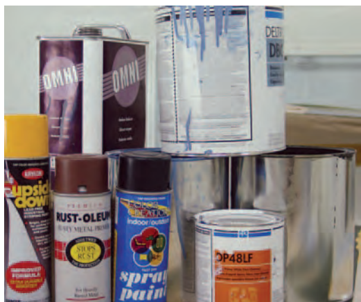
Aerosol cans and paint containers

http://www.iwrc.org/exchange/cfm/index.cfm .