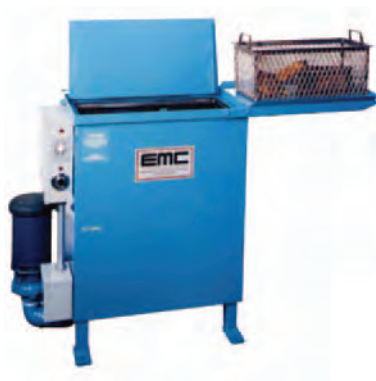
An alternative to water-based washing is this Jet-Spray washer unit