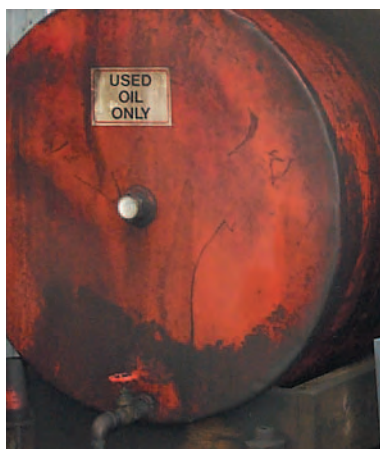
A used oil storage container

Once the bulk of the spill is cleaned, a soap and water solution may be used to clean the residual oil sheen. This wastewater can be discharged to the local wastewater treatment plant. Do not discharge this water directly outdoors or to a septic system since even non-toxic soaps can pollute soil and streams and inhibit the functioning of a septic system.