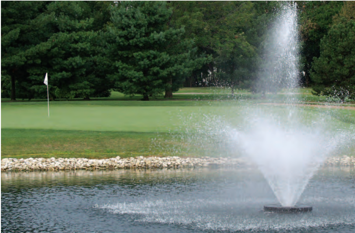
Elmcrest Country Club