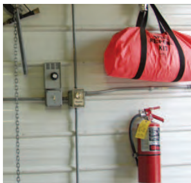
Pesticide storage spill kit

During the mixing and loading of pesticides, small spills may occur. Should an accidental spill occur, the spill(s) should be cleaned up as soon as possible. The sooner a spill is contained, the less chance there will be for harm to the environment. Always use the appropriate personal protective equipment as indicated by the MSDS or label direction for the chemical being cleaned up. Follow these steps to clean up small spills safely: