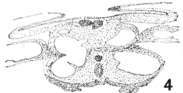
Fig. 4. The unifying dorsal and ventral halves with notochord and masses of tissue in neural tube area, (555 micron area).

cross-sections were counted to determine the length of the specimen from the anterior end to the posterior end at the base of the tail. By multiplying the numbers of cross-sections with the thickness of each section we determined the length to be 1553 microns and the approximate width 1307 microns.