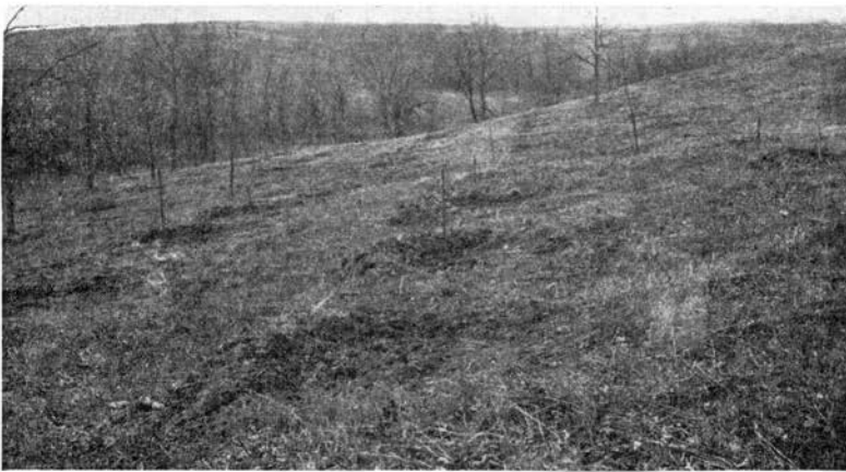
Figure 2. View of the experimental site from the east end of the plot strip, showing the arrangement, comparative size and structure of the basins at planting time, April, 1938. Note the tree covered hills in the background, which afford protection from south and southwest winds.

ping or "staggered" arrangement on the slope, a given basin was located below the space between two basins in the row above so no perceptible quantity of water was lost from the slope. Each finished basin was rounded in outline on the lower side and in general shape was slightly more than a half-circle except that the ends of the basin were somewhat attenuated. The size of the basins was approximately 6 feet long by 3\frac{1}{2} feet wide. Each basin was kept as shallow as possible for the purpose for which it was intended; to catch its proportionate part of water from the slope and hold it till it percolated. Rate of percolation on the general slope and in the basins was at least moderate, so there was no appreciable loss of water and no overflowing of the basins, although most of the basins were only 8 to 10 inches deep, measured from the top of the rim. None of them was over 1 foot deep.