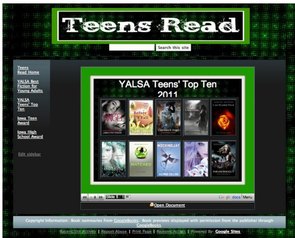
Figure 1. Teens Read Homepage. This figure illustrates the embedded Google presentation and left sidebar navigation.

The website's home page, as displayed in figure 1, includes an embedded Google presentation that continuously plays slides featuring the current year's book award lists. The Teens Read home page also links to award pages via a sidebar that is visible on every page within the site. The left sidebar facilitates convenient browsing within the Teens Read website.