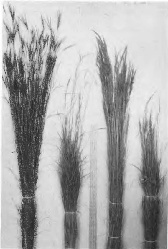
Figure 2. From left to right, big bluestem from burned area, big bluestem from unburned area, Indian grass from burned area, Indian grass from unburned area.

flowerstalks. Loomis (10) has stated that an accumulation of carbohydrate reserves would result in inducing differentiation in plants. It is also possible that the addition of ash could cause this increase of flowerstalk production, but it seems more likely that the addition of nutrients from the ash is at most only a condition for greater growth and not a direct causal factor in increasing seedstalk production. It is doubtful that the direct heat of the fire could itself cause the increased seedstalk production since increased flowerstalk production has followed burning in winter when the ground was frozen and the effect of the high temperature on the plants would be slight, but this remains a possibility until more definite information can be obtained. It seems that the increased accumulation of carbohydrate material in the plant from improved plant growth conditions is the most plausible explanation of the phenomenon of increased seedstalk production as a result of burning native prairie in Iowa.