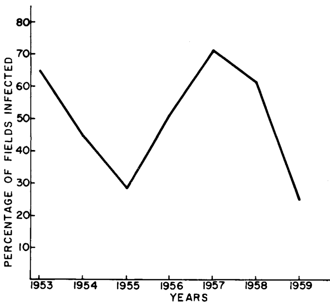
Figure 1. Incidence of bacterial blight of soybeans in Iowa from 1953 to 1959.

1 Disease rating ranges from 1 (immune) to 5 (completely susceptible)