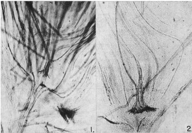
Figures 1, 2. Enlargements of the pedicel and basal portion of cleared flowers.

The survey of Dalea revealed that the xylem of the vascular bundles of the androecial tube and the gynoecium is not connected. A xylem discontinuity also exists between the androecial tube, the gynoecium and the pedicel. There is, however, continuity of phloem across the gaps. The most obvious feature is the "discontinuity plate" formed by the merger of the xylem of the gynoecial traces in a characteristic mass of tracheoidal cells. Figures 1 and 2 show these vascular peculiarities. These discontinuities are not artifacts. We have verified them in microtome sections, and they can be seen quite easily with a hand lens in fresh flowers cut in median longitudinal section with a razor blade.