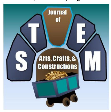
The Journal's Website:

http://scholarworks.uni.edu/journal-stem-arts/