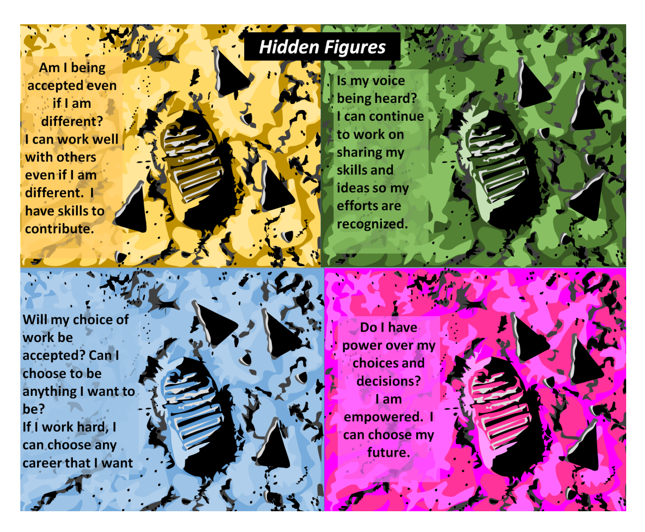
Figure 3. Example Warhol-inspired digital art related to the movie Hidden Figures featuring characteristics of a gifted student.