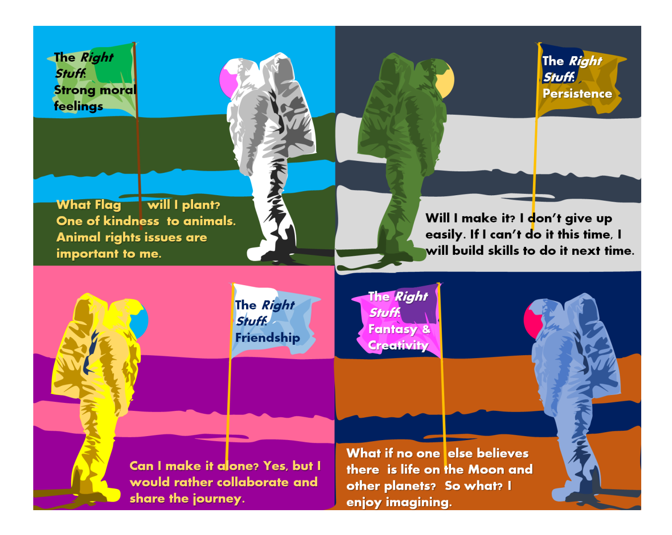
Figure 1. Example Warhol-inspired digital art related to the movie The Right Stuff featuring characteristics of a gifted student.

Figure 3 shows the footprint of the first astronaut on the moon accompanied by high-heeled footprints of the three African-American characters in Hidden Figures . The female maker of this artwork considered the identity issues the African American stars of this movie faced and how some of these themes were echoed in her own gifted development. Finally, Figure 4 shows self-sufficiency social-emotional issues raised in the movie The Martian .