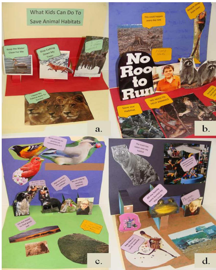
Figure 3 Interior Scenes of Student Pop-up Constructions Concerning Animal Habitats

3b chose negative images from around the world to illustrate his point. He crowded the images around the words “No Room to Run” to show how animals are losing their habitats. The student who made the display in 3c took appealing images and used contrast to make her point. The work of a final student is shown in 3d. He used humour and a mixture of photographs and cartoons to make his work interesting.