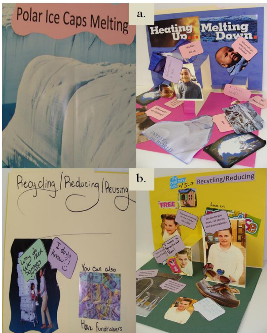
Figure 2 Student Pop-up Constructions Concerning Melting of Polar Ice Caps and Recycling, Reducing, Reusing

shows the cover and enclosed scene related to recycling, reducing and reusing. The student who made the scene in 4a used magazine phrases in a new context. He cut out a picture of a baby to voice concern for future generations. The student who made the scenes in 2b used photos of herself to highlight her agency in affecting the environment. She used an image of money to symbolize fundraising.