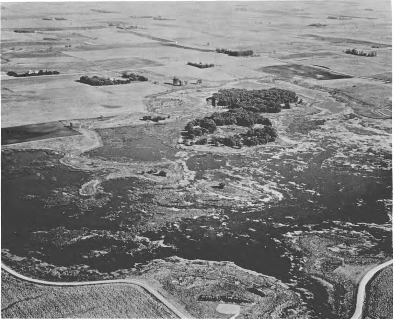
Fig. 3. State-owned type 4 prairie marsh – an island in the midst of agricultural land.

until the next drought. The open stage is not conducive to good wildlife production or to hunting or trapping recreation. Thus, the need to manipulate water levels becomes important. A dike or levee across the outlet to the wetland along with a water control structure allows the manager to artificially raise the water level in marshes which have silted in from excessive erosion or to maintain higher water levels in early spring to ensure water later in the summer. The water table lowered by tiling and drainage precludes the normal feeding of wetlands during the drier summer months. Water control also allows the manager to drain the marsh causing an artificial drought to revegetate an open marsh. Since man is a most impatient creature and the demand for maximum wildlife productivity is a priority, management capabilities are of extreme importance. We can best utilize our remaining marshes by shortening the open water periods and lengthening the productive 50-50 water-vegetative ratio.