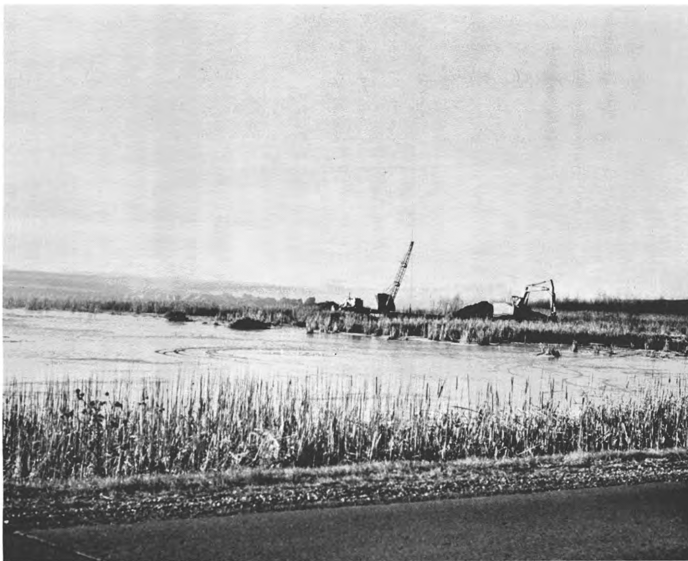
Fig. 2. Prairie marsh being drained by construction of drainage ditch.

action. This natural scenario results in shallowing of wetland basins. Deeper lakes become more shallow, shallow lakes become marshes, marshes transpose into wet meadows, and wet meadows yield to prairie or timberland. When the protective vegetation covering the prairie was destroyed by exploitation, erosion increased drastically and some marshes were destroyed in just a few years by siltation. The natural process has been altered to the point that man must continue to manipulate events to achieve a resemblance of the natural state.