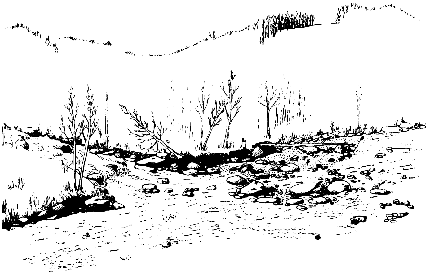
Fig. 2. This drawing illustrates the "alluvial fan or outwash deposit" which is formed when a stream entering the Des Moines River washes boulders and cobbles from the glacial deposits into the river.

especially greens and blue-greens, also become abundant in the plankton. Benthic diatoms are sparse and attached diatoms are seldom observed. A large growth of Amphora veneta was observed in the splash zones around the floodgates in the Fraser dam each June (4 years in succession) which formed auxospores after attaining maximum growth. This growth period lasts 2-6 weeks. It may be terminated by a Summer Flood which lasts 1-6 weeks, or be continuous with the Summer Growth Period.