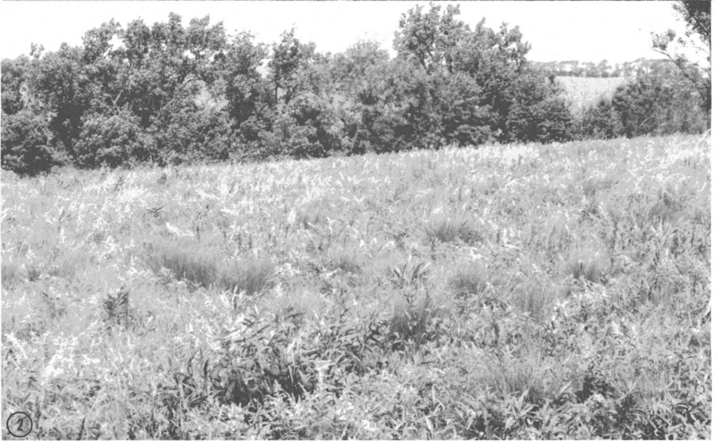
Figs. 1-2. Fig. 1. Sheeder Prairie; an 8.1 hectare (20-acre) prairie in Sec. 33, Seely Twp. Fig. 2. Prairie remnant in Sec. 17, Highland Twp.