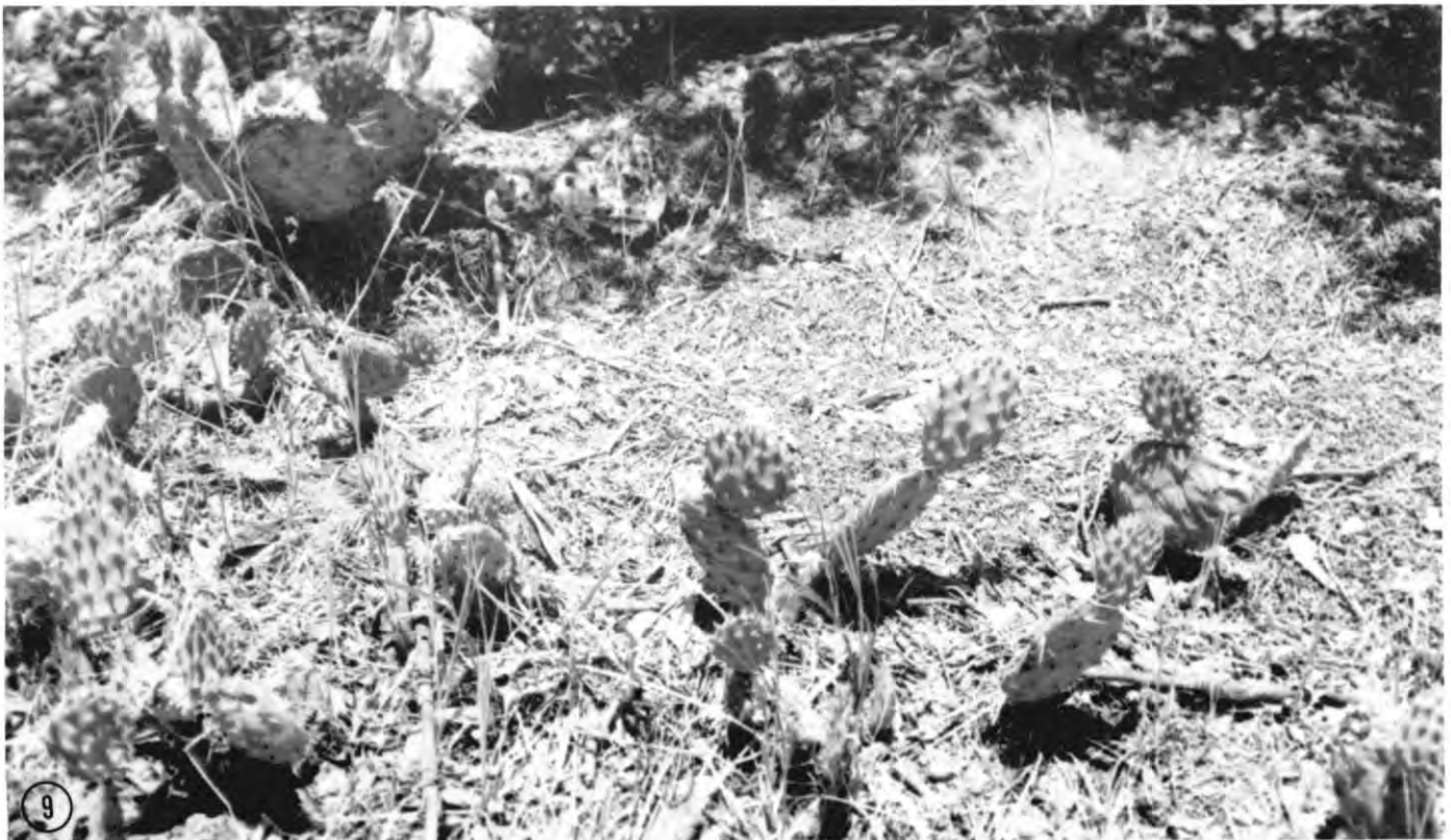
Fig. 9. Opuntia macrorhiza on gravelly knob in Sec. 29, Jackson Twp.