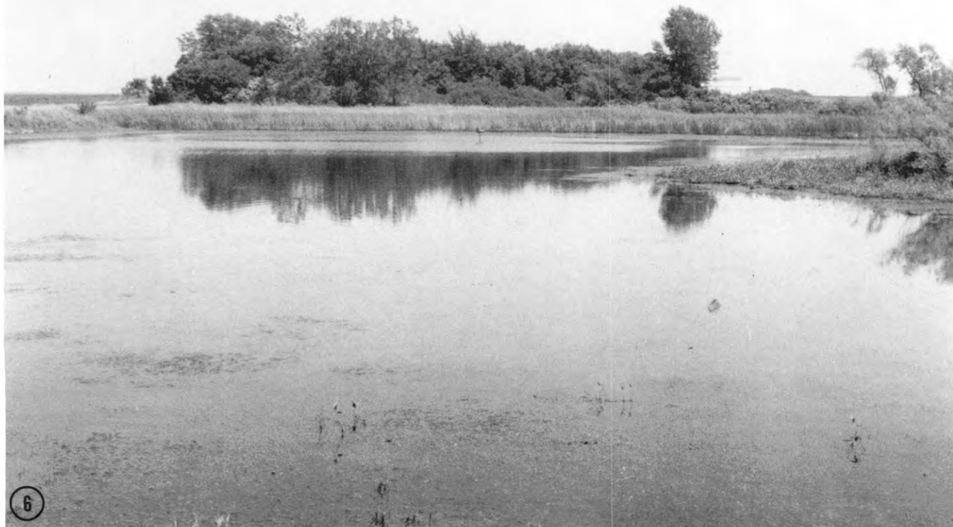
Figs. 5-6. Fig. 5. Moist woods in Sec. 14, Bear Grove Twp. Fig. 6. Lakin Slough in Sec. 3, Richland Twp.