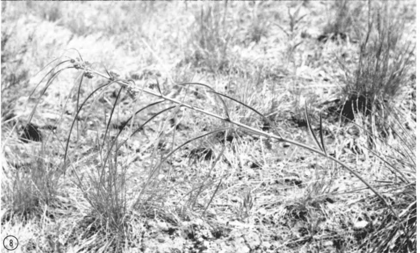
Figs. 7-8. Fig. 7. Hillside seep in Sec. 22, Valley Twp. Fig. 8. Asclepias stenophylla on gravelly knob in Sec. 29, Jackson Twp.