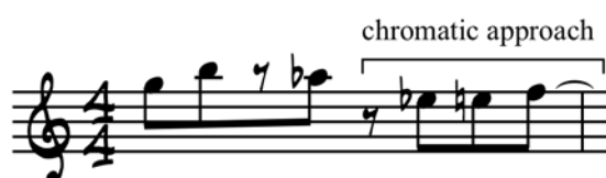
Musical Example 5

The arrangement emphasizes unison writing, orchestrated for different instrumental voices as the piece progresses. Interjections from the rhythm section occur at breaks in the melodic line, acting as a kind of call and response device. An interlude, comprised of a melodic line composed over the bridge chord changes and featuring the rhythm section, ties together the solo section and recapitulation of the head. Throughout the arrangement, the eighth note lines are inflected with Bebop articulations. This articulation of eighth note lines connects them in a legato fashion while placing slight emphasis on each up beat in the line. It can be vocalized like this: “doo-dah-oo-dah-oo-dah-oo” etc. Articulating the line in this manner allows for a fluid stream of eighth notes. Additionally, where there are instances of a rising and falling melodic contour of the line,