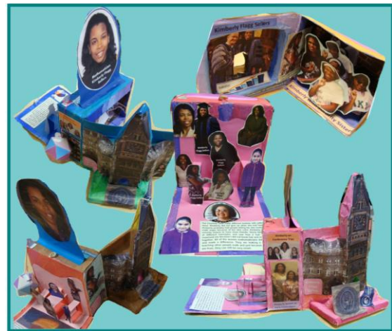
Figure 6. Example dioramas made by students. Note the pop-up construction shown in the middle image that appeared on the back side of the box.

(2016), involved fifth grade girls in exploration of the lives of contemporary diverse women mathematicians through creation of a diorama that showed scenes from one of the mathematicians' life and work. Students also wrote an essay of their connections to the featured women with an accompanying pop-up scene on the back of the diorama. The spatial thinking project of making a diorama with a cereal box cut to open like a book with a building attached to the front and a pop-up scene on an extra fold-down flap employed intrinsic-dynamic spatial thinking skills. See Figure 6.