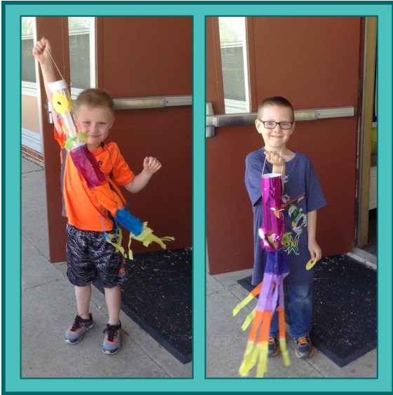
Figure 2. Two kindergarten children with their windbirds.

involved kindergarten children in the spatial movement of a windsock in the wind. Children constructed the birdlike windsocks themselves from colorful materials, folding and cutting the tissue paper kite tails. They then tested them outside in the wind by attaching them to a tree on the school grounds. Children also generated their own wind by running with the windsocks through the air. These latter explorations involved dynamic spatial thinking skills. See Figure 2.