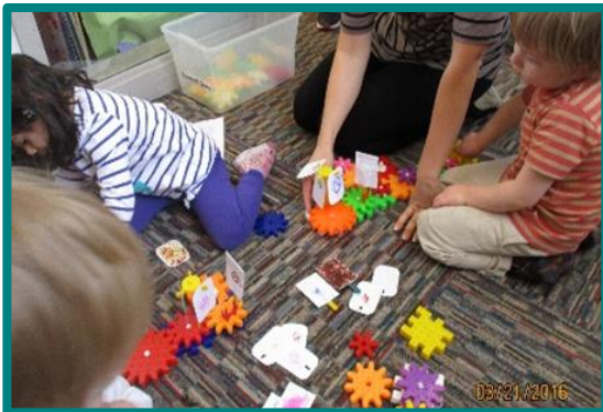
Figure 5. Children exploring motion using gears with attached artwork

Three- and four-year-olds learn about gears through arts incorporation. This research article by Dessy Stoycheva and Leann Perkins (2016) investigated whether integrating the arts with lessons on gear motion might increase memory for key concepts and improve motivation. Although children remembered concepts about gear motion to a similar degree under both conditions, the arts-integrated condition was found to create a more enjoyable working environment. See Figure 5.