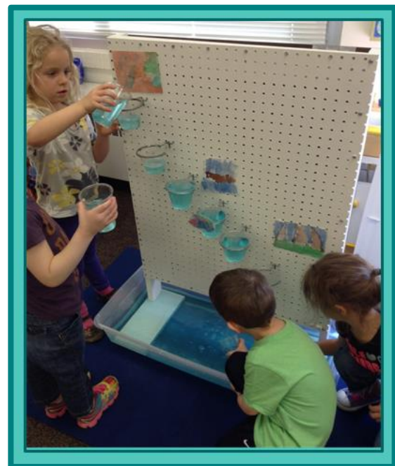
Figure 1. Preschoolers solving the spatial puzzle of directing a falling stream of water.

Water play. This article by Jane Cline and Brandy Smith (2016) describes intriguing activities with a vertical water table made by the first author and shown in Figure 1. The project involved preschool children in a literacy- and art-integrated project in which they arranged cups of water with holes drilled near the bottoms of cups to form a stream of flow from top cup to bottom cup. This stream represented the stream in the story Three billy goats gruff (e.g., Galdon, 1973, Asbjørnsen & Moe, 1957). Children made watercolor illustrations of characters and bridges for the story as they retold the events. The problem of arranging the cups to allow water to flow from one to another involved extrinsic-dynamic spatial thinking skills.