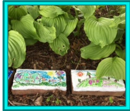
Figure 3. Example decorated paving stones in the garden.

Second graders beautify for butterflies. The primary students in this article written by Andrea Anderson and Jessica Meier (2016) created a nature space with plants to attract butterflies and other pollinators at their school to beautify the school grounds and to study the relationships between plants and animals. Students planned environmental messages and facts about pollinators for the concrete pavers by first gathering information and then making sketches. The sketches were implemented on gesso-coated concrete paving stones with permanent markers. See Figure 3 for example paving stones placed in the garden. Students practiced intrinsic-static skills as they made the sketches, but each sketch became a frame of reference for the final work on the concrete paver, exercising extrinsic-static spatial thinking skills.