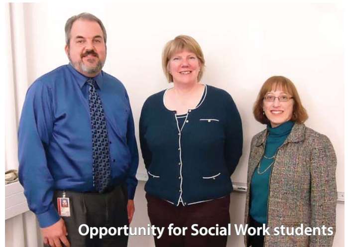
Opportunity for Social Work students