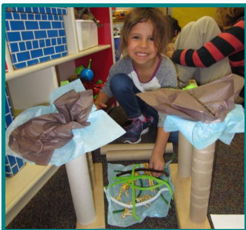
Figure 6. A creative animal habitat construction.

Second Research Article. The second research article titled, Zebras and jaguars, Oh My! Integrating science and engineering standards with art during prekindergarten block time , was authored by Brandy Smith and Jane Cline (2016). This study compared student animal habitat block constructions when provided additional art materials or not. The study also investigated student recall of animal habitat information under the two conditions. The authors examined student motivation and creativity during this study, finding that these were enhanced by the incorporation of art materials. A preview of one of the constructions made in the experimental condition is show in Figure 6.