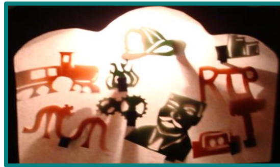
Figure 4. Shadow puppets made by preservice teachers used in a puppet play about African American scientist Granville T. Woods.

puppets the preservice teachers made to illustrate their scripts are included. See Figure 4 for an example.