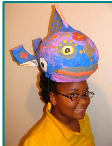
Figure 7. Student wearing the helmet crest mask she made.