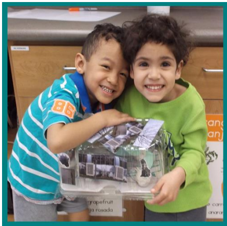
Figure 3. Preschoolers with the greenhouse model they created.

visiting a greenhouse and making a model. The authors of this article titled, Preschoolers explore greenhouses by visiting a greenhouse, making a model, and growing plants , were Leann Perkins and Dessy Stoycheva (2016). Preschoolers created their greenhouse models by turning a clear plastic rectangular bin (recycled from being a container in which salad greens were sold) upside-down and decorating it with photographic stickers made from photos taken during their greenhouse visit. Inside, students not only placed models of plants they had created, but planted bean seeds in small plastic bags filled with moistened cotton that were taped to the greenhouse interior wall. Students watched the bean plants sprout and emerge inside the model greenhouses. See Figure 3 for a preview of an image from this practical article.