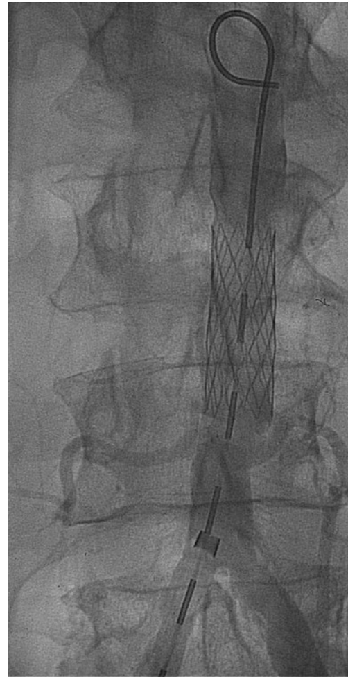
Fig. 4 Multimodal treatment algorithm for the management of the isolated dissection of the abdominal aorta

The remaining two patients of group 2 presented with irreversible spinal cord ischemia were treated conservatively.