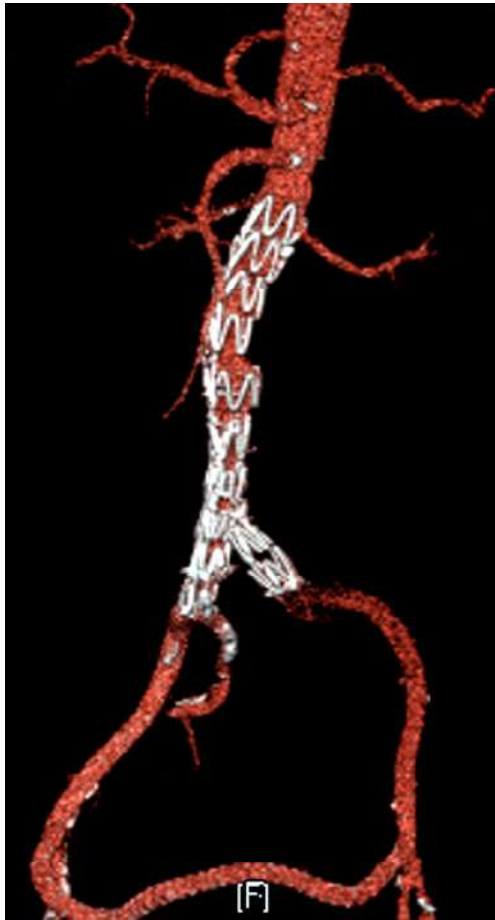
Fig. 3 a Computed tomography (virtual reconstruction) of a patient with isolated dissection of the abdominal aorta treated conservatively. b Healed spontaneously with best medical treatment

other patient (5.6 %) was treated with a bifurcated stentgraft device (Excluder, WL Gore & Ass., Flagstaff, AZ, USA). Following EVAR, no endoleaks, material failure, or migration of the stentgraft was observed during follow-up. One patient with claudication received a Palmaz stent XXL (14/40 mm, Cordis Corporation, Miami Lakes, FL, USA) in the infrarenal aorta for closure of the proximal entry and aortic remodelling (Fig. 4).