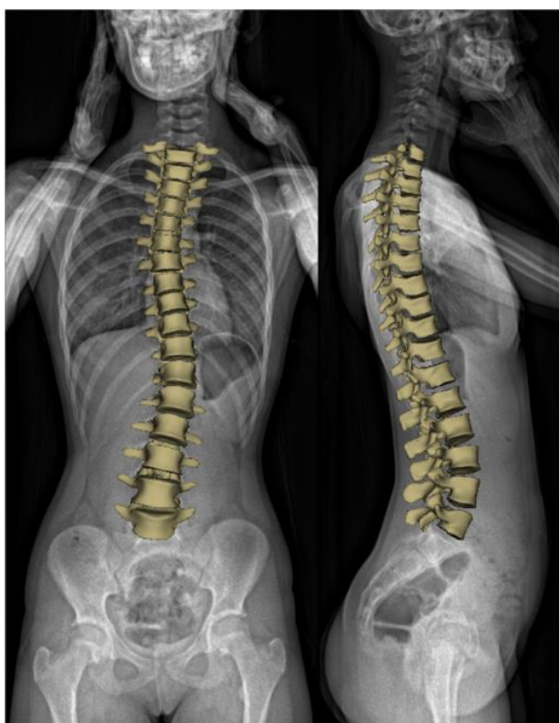
Fig. 2 Examples of 3D reconstruction from reduced micro-dose protocol, coronal and lateral views

A validated method of 3D reconstruction of the spine from EOS 2D biplane images was used [15]. Patient data and acquisition settings were blinded and reconstructions took place in random order. Three operators, all trained within 3D reconstructions, did two reconstructions for each obtained image. One operator determined, for each patient, the levels of junctional and apical vertebrae for each scoliotic curve. Table 2 lists the 3D parameters investigated. Figure 3 illustrates 3D reconstruction images using the reduced micro-dose protocol.