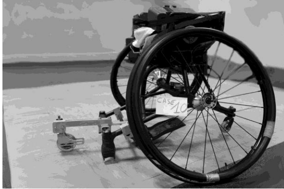
Figure 1: MWC, custom fork and additional masses

An inertial measurement unit (MTi, X-sens, The Netherlands) was placed on the frame of a sport MWC whose front wheels were removed and replaced by a custom fork device (Figure 1).