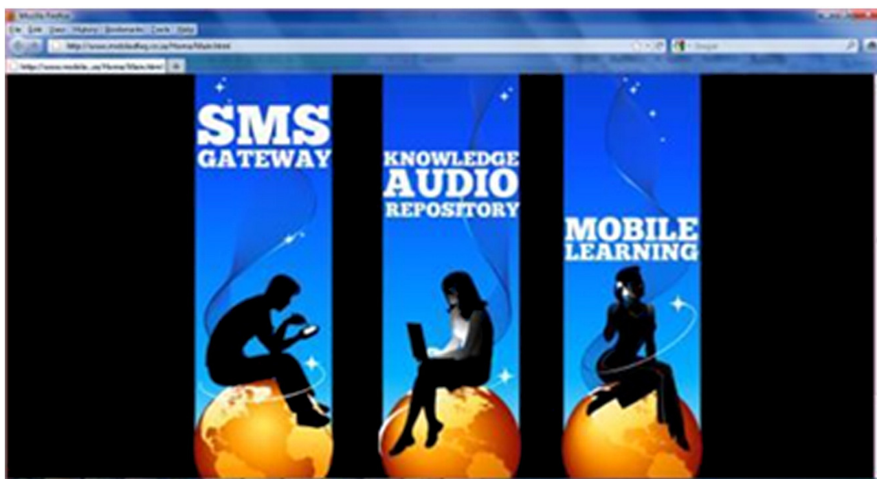
Fig. 1. The Knowledge Audio Repository and related interfaces.

While there was a gender imbalance in the sample of participants, the sample seemed to be reflective of the participants enrolled on these courses, which tended to be male dominated (see Table 1). As such, the researchers had no control over the gender distribution of participants. More so, the majority of the research participants were enrolled or previously enrolled for a Masters in ICTs in Education at this university. Most of their topics were linked to the adoption and effective utilisation of ICTs or the complexities of ICT adoption in resource-constrained environments. All participants interacted with the KAR, which mediated their DST for six months (July to December).