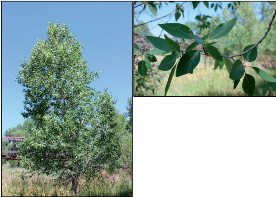
Fig. 2. Pemphigus spp. prefer poplars in the genus Populus , such as this narrowleaf cottonwood ( P. balsamifera ) as their primary host.