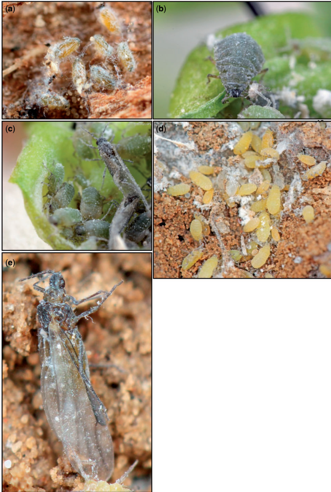
Fig. 4. Different life stages and morphs found in the life cycle of P. betae . Pictured are eggs (a), a fundatrix in a gall (b), fundatrigeniae in various stages of development in a gall (c), alienicolae on sugar beet roots (d), and sexuparae amongst alienicolae on a sugar beet root (e). The eggs could not be confirmed with certainty as belonging to P. betae , but dead bodies of both sexuparae and sexuales were observed on the bark of the trees from which the eggs were collected. Furthermore, an aphid hatched from one of these eggs, but died in the absence of its host. The white filamentous material surrounding the eggs also conforms to the description given by Harper (1963).