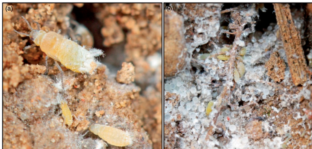
Fig. 1. Waxy filaments secreted by individual aphids (a) gives the colony a moldy appearance (b).

The roots of the secondary hosts serve as the site of summer colonization. Secondary hosts for P. betae include sugar beet, common lambsquarters ( Chenopodium album L.), kochia ( Kochia scoparia (L.)), Rumex L. spp., and pigweed ( Amaranthus L. spp.) (Blackman and Eastop 2006, Hein et al. 2009). In addition to these, Harper (1963) reported that laboratory-reared P. betae established colonies on Swiss chard and red beets, spinach ( Spinacia oleracea L.), and alfalfa ( Medicago sativa L.). However, alfalfa proved to be a poor host for this aphid species.