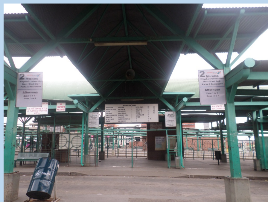
Bus rank in Bloemfontein with information display boards