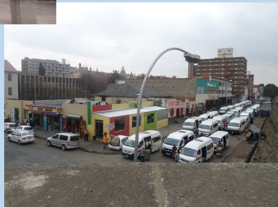
Mini-bus taxis at a taxi rank