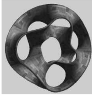
Figure 2b: Hyperbolic Heptagon C Sequin & B Collins