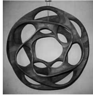
Figure 3: Heptoroid, C Sequin & B Collins

The hybridisation of new and traditional technology is evident in the direct FDM build of ABS plastics, wax expendable models, LS powder builds and SLA Accura® Amethyst® resin, which can be burnt out during the traditional investment casting process with limited mould defects. The ceramic shell investment of RP master built models is particularly suited to complex forms where it would be difficult to make a traditional flexible rubber mould from an existing master pattern for the casting of a secondary wax. However, the ceramic shell moulding and burnout technique of these RP built models for the investment casting of metals remains a delicate process and an area in need of additional research. Problems occur as a result of the following: residues left within the mould cavity, mould damage due to the expansion of the various material builds during burnout, pattern distortion as a result of warm weather, incomplete bonding of shell layers and surface defects due to pattern porosity (Dickens, Stangroom, Greul and Holmer, 1995). Direct RP methods of arriving at a model are still regarded as more costly than traditional moulding and wax pouring of secondary models currently used by most foundries. However, the disadvantage of traditional indirect model reproduction via flexible rubber mould is that it is restricted by complex form.