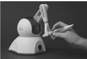
Figure 1: Omni PHANToM haptic device (SensAble Technologies, 2007)

The loss of human-connectedness through automation will remain a limitation within this new artistic form until computer technology input modes successfully evolve to replicate the physiology of human sensory touch. In an attempt to break free from the mouse-driven CAD input approach, the development of a less constrained, more naturalistic input mode is the innovative "haptic device" a design interface developed by SensAble Technologies (Figure 1).