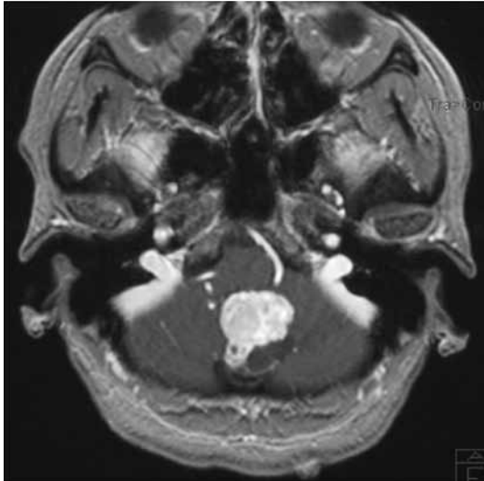
Fig. 1. Gadolinium (Gd) -enhanced T1-weighted magnetic resonance (MR) image showing a strongly enhanced mass compressing the inferior vermis and medulla oblongata.