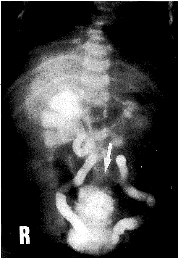
Fig. 2. Retrograde cystogram shows the deformity of bladder (arrow) and vesicoureteral reflux.

Coronal magnetic resonance imaging (MRI) confirmed the rupture of the right renal parenchyma and the presence of a pararenal pseudocyst and urinary leakage (Fig. 1. B). A retrograde cystogram showed a neurogenic bladder and vesicoureteral reflux (VUR) with deformity of the bladder (Fig. 2). A trochar and cannula were inserted into both the bladder and the renal pelvis and 1,000 ml of amber fluid was aspirated. Having thus deflated the bladder and cyst, it became apparent that both kidneys were mesh-like and the left kidney functioned poorly. The patient has been free of any leakage for one year and is now improving in health.