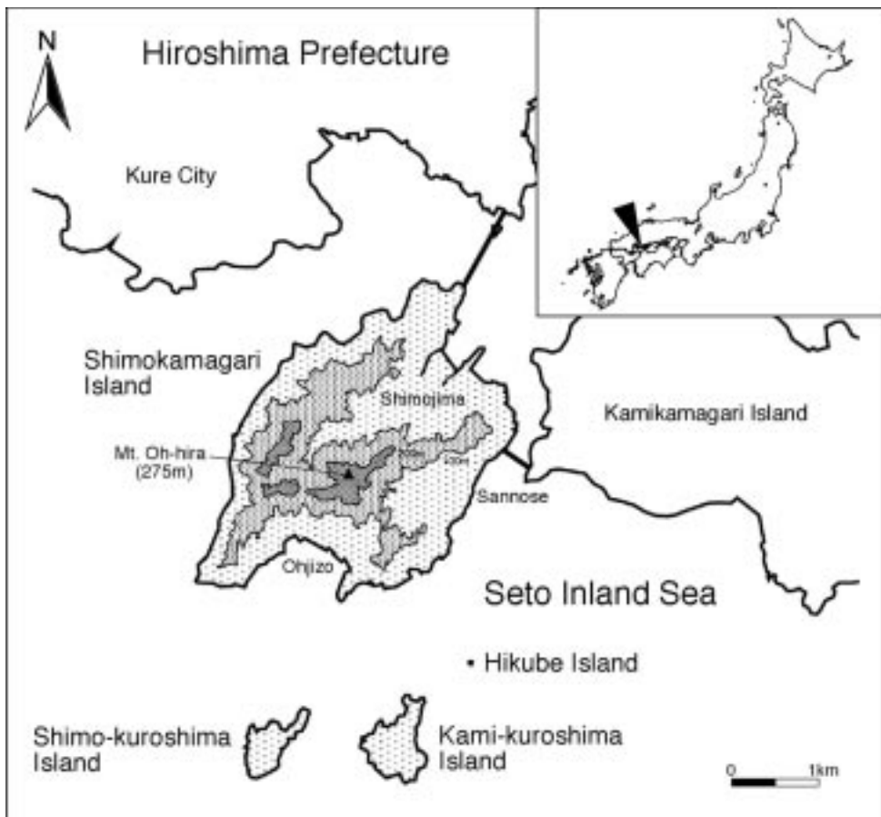
Fig. 1. Map showing the study area. The three altitudinal zones are (◻): <100m, (▨): 100-200m, and (■): >200m.

Shimokamagari Island was connected with Honshu by the Akinada Bridge in 2000, and the municipality was absorbed by Kure City in 2003.