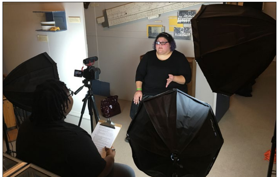
Students ask interviewees about their perception of reproductive justice, how others have responded to their choices and if they feel that they have been pressured to make a decision.

Fisher and three other students are inviting individuals to be interviewed, hosting the interviews and editing the documentary over the summer.