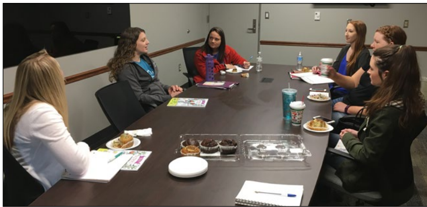
The group meets weekly to review books throughout the semester, share progress reports and ask for advice on handling difficult situations.