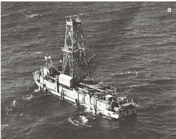
FIGURE 1. (a) The drilling vessel CUSS I as used during phase 1 of Project Mohole. (b) A first examination of cores onboard ship during Project Mohole.

drilling barge CUSS I (Figure 1a), to which four large outboard motors had been added so it could operate as the first dynamically positioned drilling vessel in the world (Bascom, 1961). In a successful demonstration, phase I cored 170 m of sediments and 13 m of underlying basalt at a deepwater site offshore Baja California (Figure 1b). Huge public interest developed, thanks to a prominent article by the famous novelist John Steinbeck in Life magazine (Steinbeck, 1961). Recovering subseafloor basalt was a major scientific accomplishment at the time, so much so that it inspired a congratulatory telegram from US President John F. Kennedy