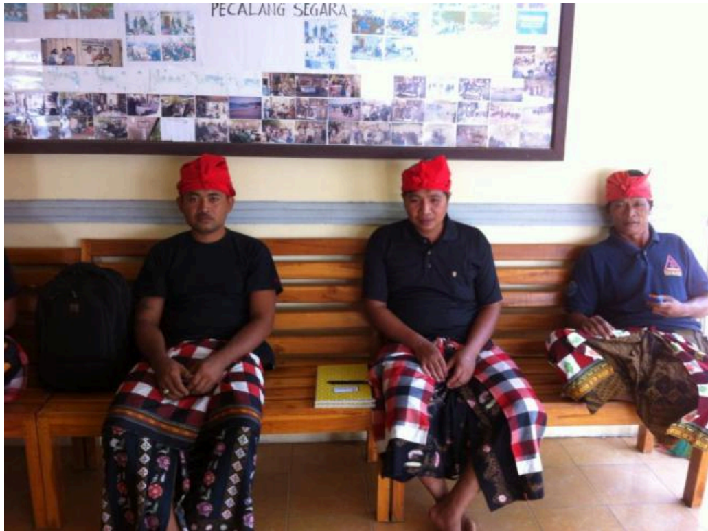
Figure 4: Pecelan Laut in their shorefront office in Pemuteran

Despite its ailing reefs, Lovina's reef management organizations have mandatory membership for anyone operating a boat for reef tourism purposes. Members pay required monthly dues in the form of a percentage of earnings, and readily acknowledge that this is to avoid free riders benefiting from their hard work protecting the reefs. This demonstrates local understanding of the ideas behind common pool resource management theory. Stakeholders use dues for insurance and for infrastructure upgrades such as mooring buoy replacements on local snorkel and dive spots. Members exhibited a large degree of familiarity with one another.