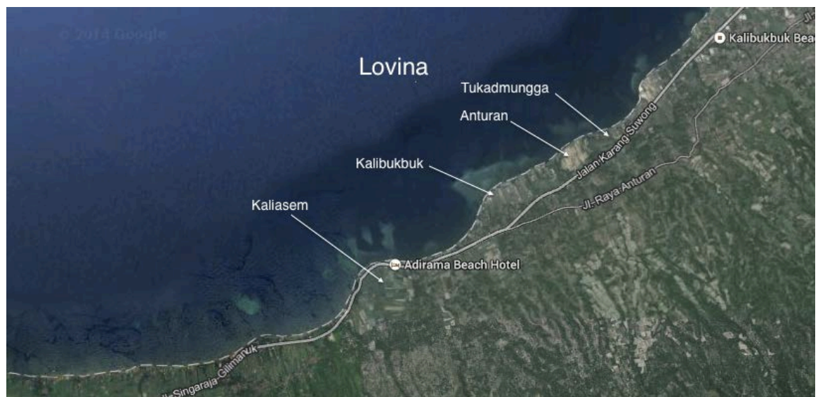
Figure 1: Lovina