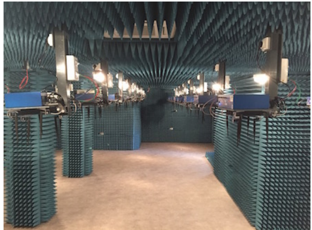
Figure 1: R2lab room

Room characteristics. The R2lab platform sits in a 90m 2 insulated anechoic chamber located in a basement of a building at Inria, Sophia Antipolis, France. Figure 1 shows a snapshot from inside the room and Figure 2 the topography. It hosts thirty-seven PC nodes on the ceiling scattered on a fixed grid; more than half of the nodes feature an SDR board, of various kinds. Such an environment