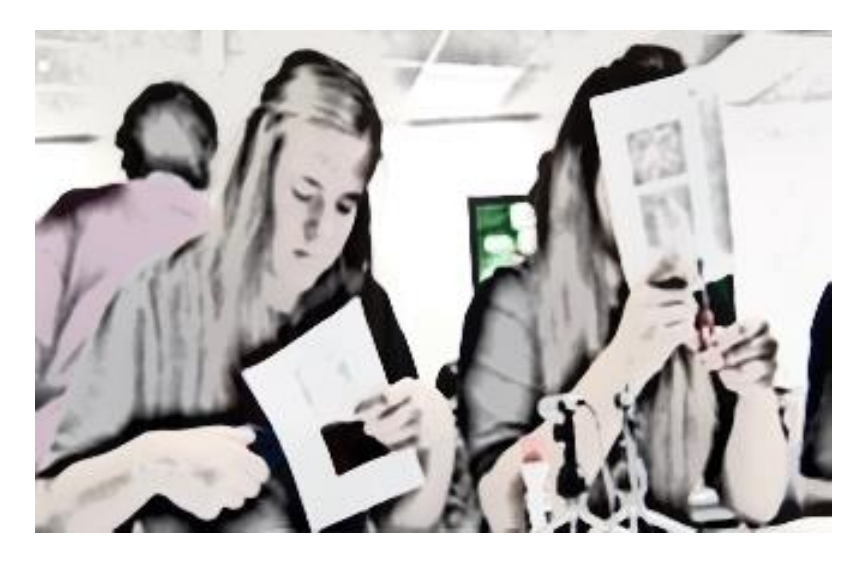
Fig. 4: O and K use scissors to cut paper (a schooled voice)

past experiences, then understanding what led K to infer O's action needs further unpicking though consideration of coherence in this text. In Hallidayan (1978) terms, coherence is achieved through the context of situation and the context of culture.