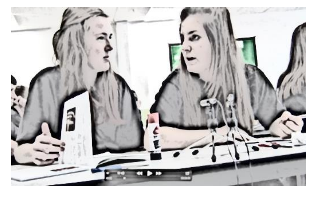
Fig 6: Synchronic middle distance gaze 03.06

The examination of the mode of gaze direction through the cohesive device of repetition tells us about the degree of empathy and rapport between the two girls as they work – remembering La France's (1985) observation that 'more is more', meaning the more convergence and alignment in interaction, the more rapport and empathy is present .