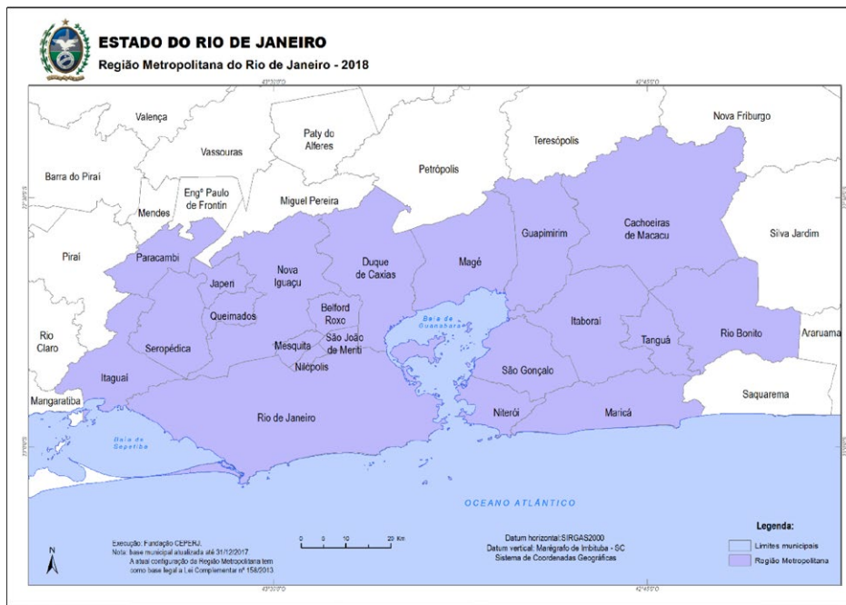
Figure 2: Shows the map of the metropolitan region.

proposed evacuation of about a thousand families from the sandy area to new homes would affect the collection of security fees significantly.