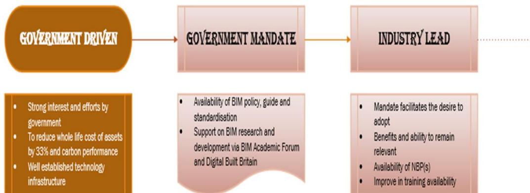
Fig. 2. The UK efforts to adopt BIM

Although, contract that supports collaborative BIM processes was amongst the recommendation by the Australian construction industry stakeholders, there is still no published contract form incorporating the BIM process in the Australian market, other than a bespoke contract which is conventionally adopted even at the highest of the most broadly used levels of BIM (level 2) [17].