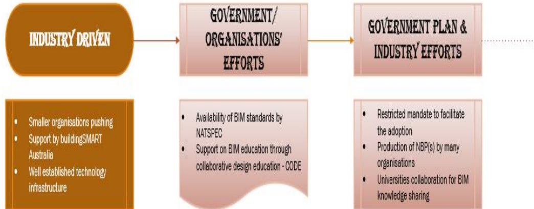
Fig. 3. The Australia efforts to adopt BIM