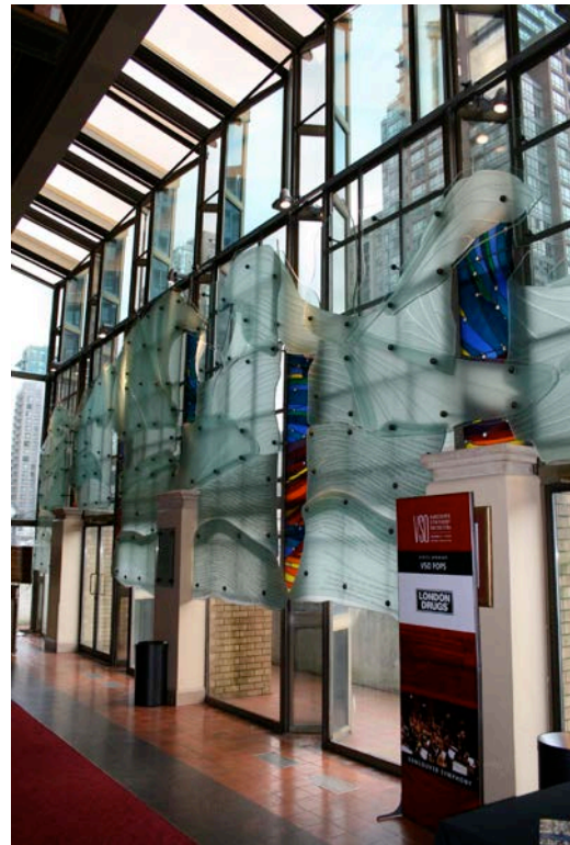
Figure 7: Newly constructed public entrance area