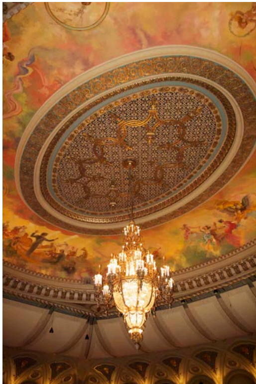
Figure 6: Re-painted suspended auditorium ceiling