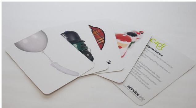
Figure Pack of 40 Service TRIZ cards with instructions and examples

The service TRIZ cards have on one side an image that has been designed to encapsulate the principle shown on the reverse and provide a visual stimulus. See Figure 3