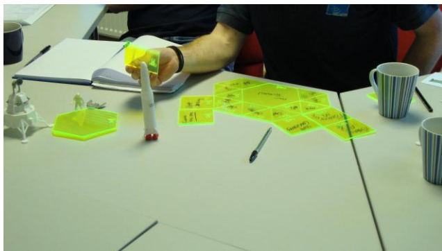
Figure 2 Perspex shapes used to design the footprint of a new imaginary Spaceport.

If time allows additional constraints can be placed on the participants either by imposing a maximum fixed perimeter in which the design has to fit or giving a value to each shape and an overall budget.