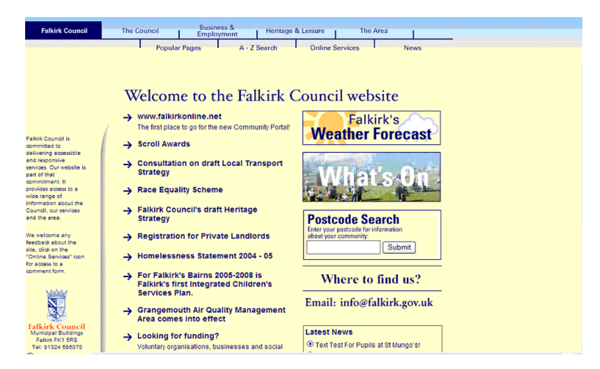
Figure 2: Screenshot from Falkirk Council website taken in Feb '06

Figure 2 shows a screenshot from Falkirk Council's website which had a poorly constructed frameset, inconsistent navigation, generally unprofessional appearance and rather poor information provision.