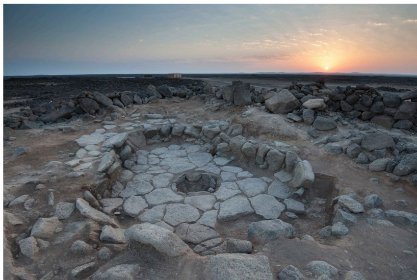
Fig. 2. The site of Shubayqa 1 showing Structure 1 and one of the fireplaces (the oldest one) where the bread-like remains were discovered.

At Shubayqa 1, a total of 24 food remains were categorized as bread-like products based on the estimation, quantification, measurement, and typological classification of plant particles and voids visible in the food matrix ( Materials and Methods ). From these, 22 were found in the oldest fireplace and 2 in the youngest. Macroscopically, all fragments showed a starchy, often vitrified, microstructure and irregular porous matrix, indicative of well-processed food components (Fig. 3A and SI Appendix, Figs. S1 and S8 ). The average size of the remains was between 4.4 mm width, 2.5 mm height, and 5.7 mm length ( SI Appendix, Table S1 ). The basic classification system based on height measurements suggests that they probably represent unleavened flat bread-like products, as their height was <25 mm (13). This idea is supported by the size of the voids. In modern leavened breads, voids are >1 mm in size and commonly cover 40–70% of the matrix (14). The size of the voids of the bread-like remains from Shubayqa 1 was 0.15 mm on average and they were present in 16% of the matrix ( SI Appendix, Table S2 ). These results are in agreement with finds identified as “flat breads” from several Neolithic and Roman age sites in Europe and Turkey (2, 11, 12).