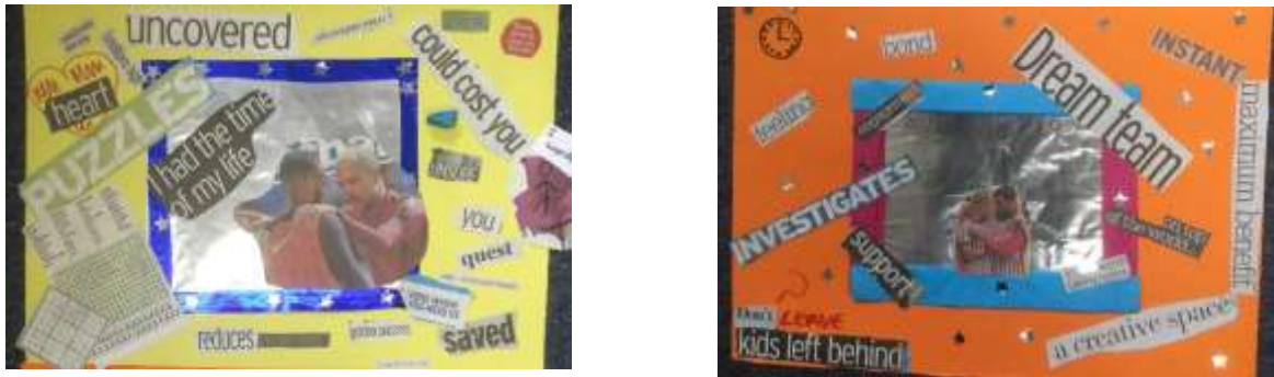
Figure 6. The teacher’s perspective is on the left and the pupils’ on the right.

Another metaphor included that of going on a ‘journey’ (Figure 7) with images ranging from footsteps, to paths, to a stair-lift going on a ‘never-ending journey’. Their expressed intention was that ‘the very good teacher will never stop reflecting on their practice ... if they have then they are no longer a good teacher’. This could possibly indicate a move towards the ‘advanced beginner’ and the increased development of thoughtful insight about their practice.