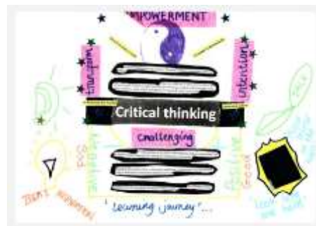
Figure 10. Collage with image of yin and yang.

Figure 10 also represented the shape of a crown as the trainees explained that the result of effective critical thinking led to their empowerment as a teacher. This appears to resonate with Brookfield (1995) and his assertion that the lack of criticality can potentially lead to a disenchantment with the role.