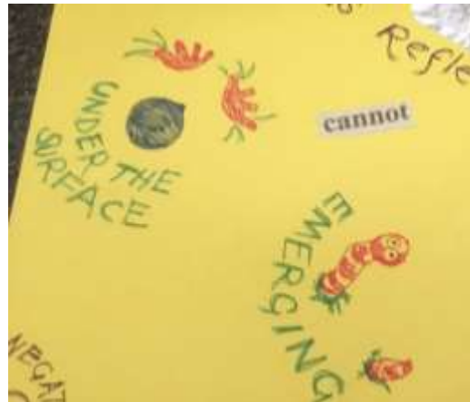
Figure 13. Issues that emerge.