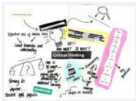
Figure 9. Collage with image of balance.

for one pupil may not work for another; indicating again a possible move towards the stage of ‘advanced beginner’ with a recognition that rules are conditional and that greater flexibility is necessary.