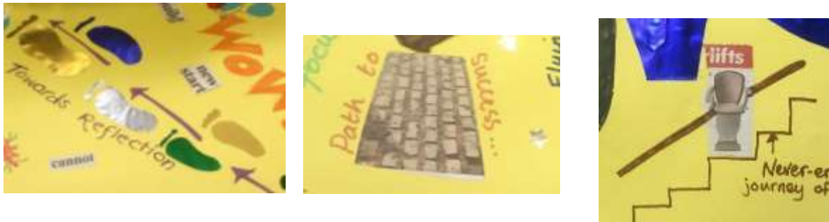
Figure 7. Extracts from collages showing a representation of a ‘journey’.

Another metaphor included that of going on a ‘journey’ (Figure 7) with images ranging from footsteps, to paths, to a stair-lift going on a ‘never-ending journey’. Their expressed intention was that ‘the very good teacher will never stop reflecting on their practice ... if they have then they are no longer a good teacher’. This could possibly indicate a move towards the ‘advanced beginner’ and the increased development of thoughtful insight about their practice.