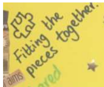
Figure 11. Two different representations of a puzzle.

Explanations of their collages provided an indicator of the level of expertise at which they were working. One collage (Figure 12) showing a picture of a class of children with the caption ‘it’s not my fault’ was intended to express the idea that if ever anything is amiss in a lesson it is the fault of the teacher. In discussing this further, trainees shared critical incidents that had occurred in the classroom. Tripp (1994:69) describes critical incidents as being those events, which can routinely occur in professional practice but are ‘critical in the sense that they are indicative of underlying motive and structures’. The recognition of these incidents and the perspectives that the trainees took on them suggested a further shift towards the advanced beginner stage.