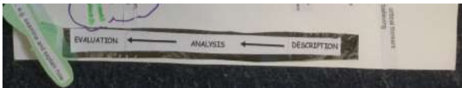
Figure 4. The 'evaluation-analysis-description' strip has been extracted from Hilsdon's Linear model of critical questions (2010:4).

The provision of three different approaches, in the pre-reading, was intended to support differing levels of engagement. It was interesting to note that not all trainees had engaged with the pre-reading at all, claiming time constraints. One trainee commented about the Brookfield article, 'I read the first two pages and found them interesting but then got lost in the rest and I just hadn't the energy'. However, it became apparent during the course of the session that certain ideas from the reading, particularly relating to Hilsdon's critical questions (2010), had obviously resonated with them and were included in their collage (Figure 4). This lack of time and energy to engage with reading also validated our decision to provide a space outside the demands of school practice and allow time to reflect as a group on their practice and move towards becoming an increasingly critically reflective practitioner.