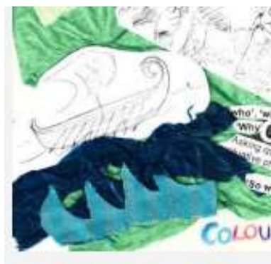
Figure 8. Collage with crumpled tissue.

However, within this more obvious metaphor, the collage process also took their thinking on more unexpected routes; for example, one trainee wanted to ensure that it was understood that her use of crumpled tissue was to indicate that critical reflection is never plain sailing (Figure 8).