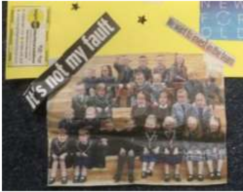
Figure 12. It's not the children's fault.