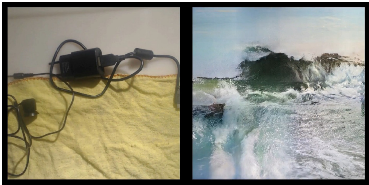
Fig. 1. A frame from Learning to See using a model trained on ocean waves. Left: live image from camera. Right: output from the software. (© Memo Akten, 2017)

Our instrument can be described as an image-based artificial neural network trained on a number of different custom datasets, making predictions on live camera input in real time. Our system processes the live camera image and reconstructs a new image that resembles the input in composition and overall shape and structure, but is of a particular nature and aesthetic as determined by the different datasets, e.g. the ocean, flames, clouds, flowers, etc. We also use the same system to create and present a video artwork (this can be viewed in the accompanying video at https://vimeo.com/332185554 at 00:00–03:02). Figures 1 and 2 show example frames.