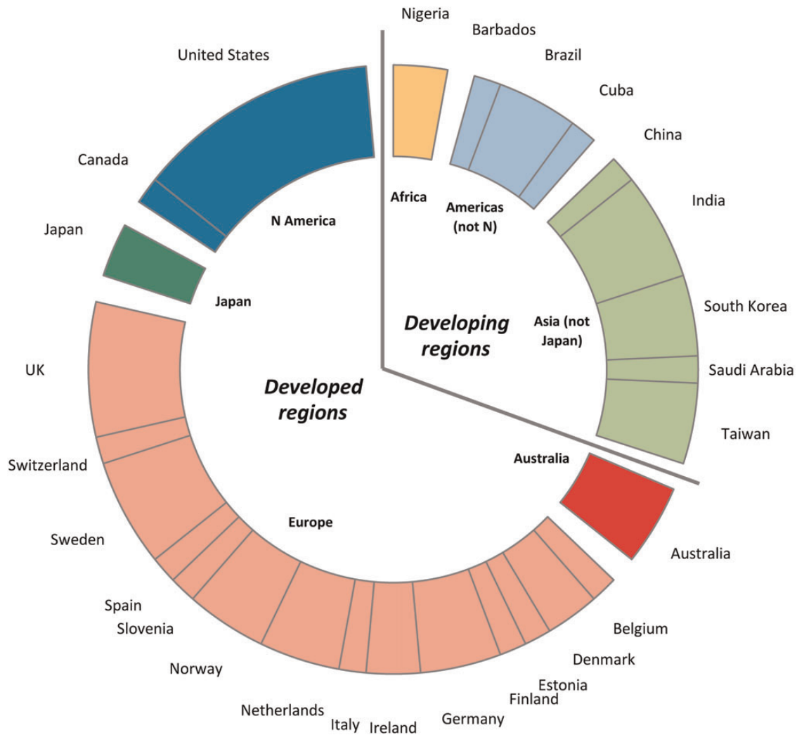
Figure 1. Country setting of included samples by UN region. The chart shows the country setting of the 63 included samples, grouped by UN region.