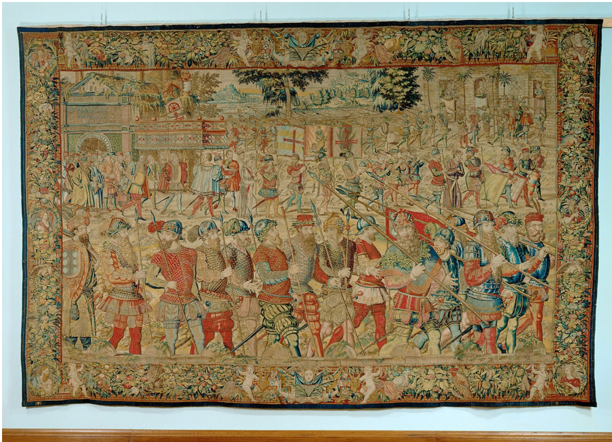
Plate 3. Triumphal entry into Goa by the Porta S. Catarina, 1547 (Kunsthistorisches Museum in Vienna, Kunstkammer, T XXII 10). Historians debate as to whether this is the second (Aquarone 1968, vol. II, pl. 39), the tenth (Kunsthistorisches Museum, Vienna) concluding tapestry, or the lead in a sub-set of three ‘triumphal’ tapestries (Mascarenhas 2016, 57) in a series woven in Brussels around 1555 to celebrate Castro’s achievements. The victorious governor marches underneath a dais.