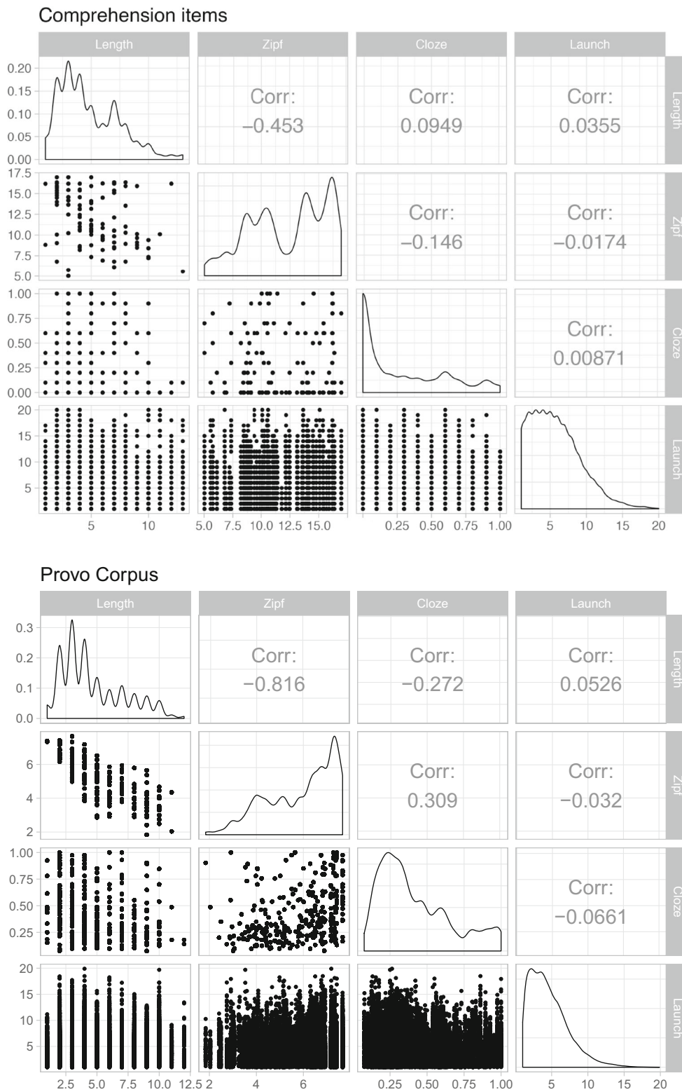
Fig. 1 Correlation coefficients, scatterplots, and distributions for variables in the comprehension (top panel) and Provo Corpus (bottom panel)