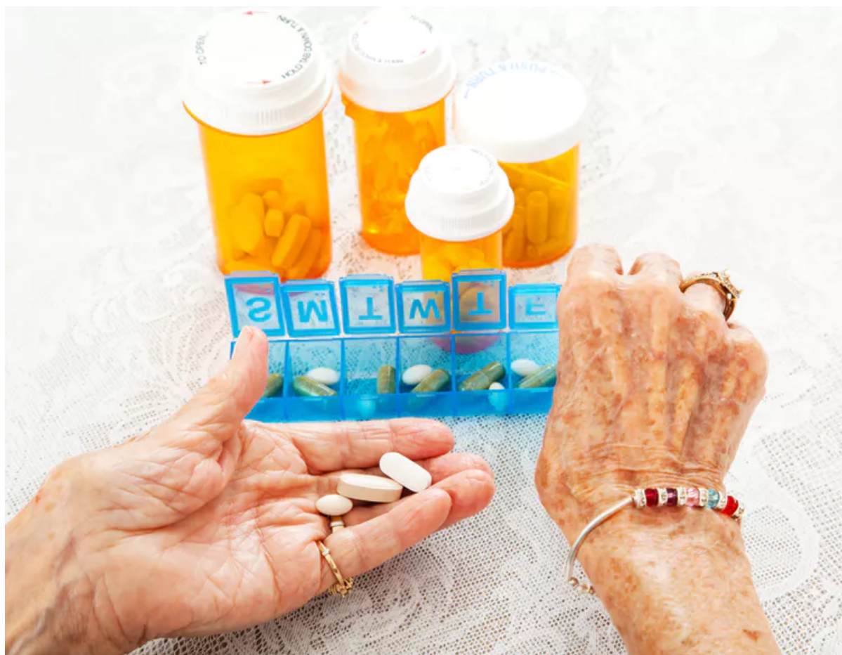
Organising medications can be difficult.

In reality this means that some older people may struggle to remember to take these complex regimens of medications – particularly if they suffer from any symptoms of dementia. And of course if they don't take the medicines properly, their illnesses may get worse or they may suffer nasty side effects.