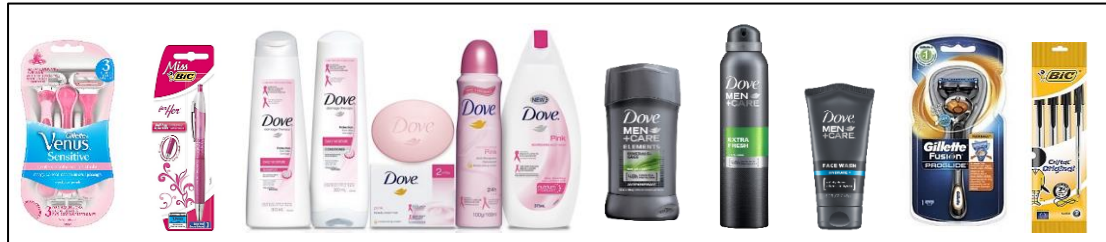
Figure 2: Gillette razor and Bic Pen. The Dove products targeted towards women are on the left and products targeted towards men are on the right (the product photos are printed with all rights reserved)

As illustrated above, the most successful leading brands have embedded masculine or feminine attributes in their advertisements. Advertisements portray patterns that feature specific gender subjects. This includes popular gender representations focused on displaying gender differences between males and females based on stereotypes (Goffman, 1987).