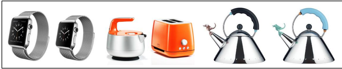
Figure 1: Apple watch and Kettle and toaster by Marc Newson, Alessi's hob kettle by Michael Groves (the product photos are printed with all rights reserved)