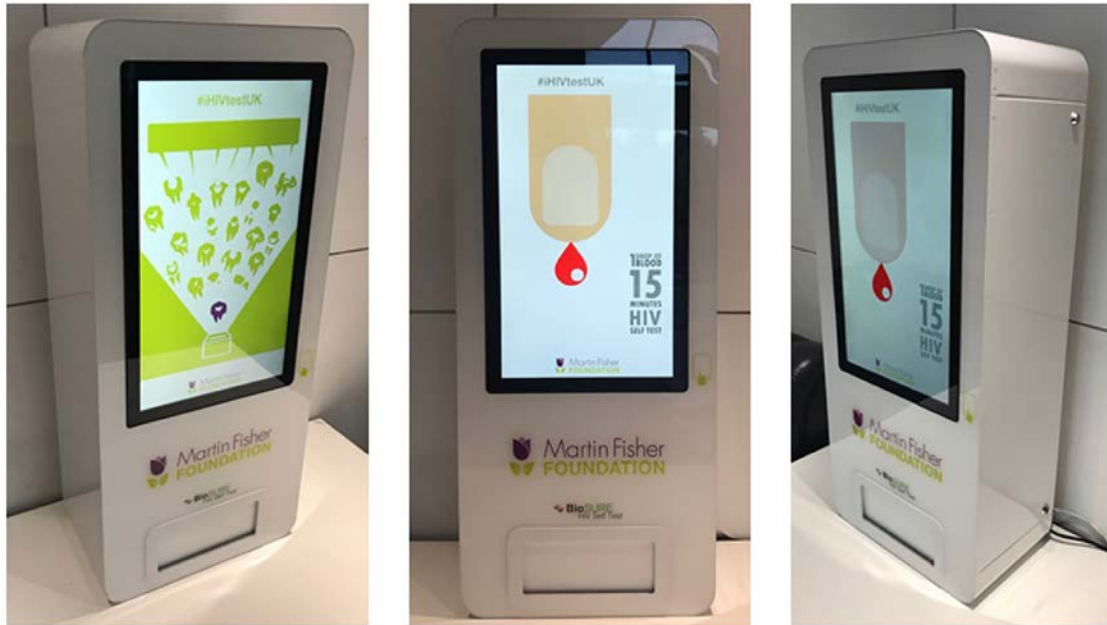
Figure 1. Bespoke vending machine to distribute HIV self-test