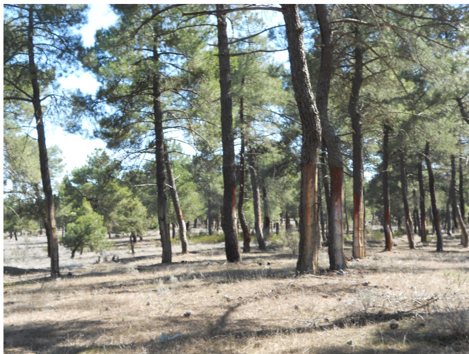
Figure 2. Landscape of the centuries old culture of pine trees for resin. Example of a mono-specific woodland ( Pinus pinaster Aiton) on the plains of the Douro River Valley (Province of Segovia, Spain)