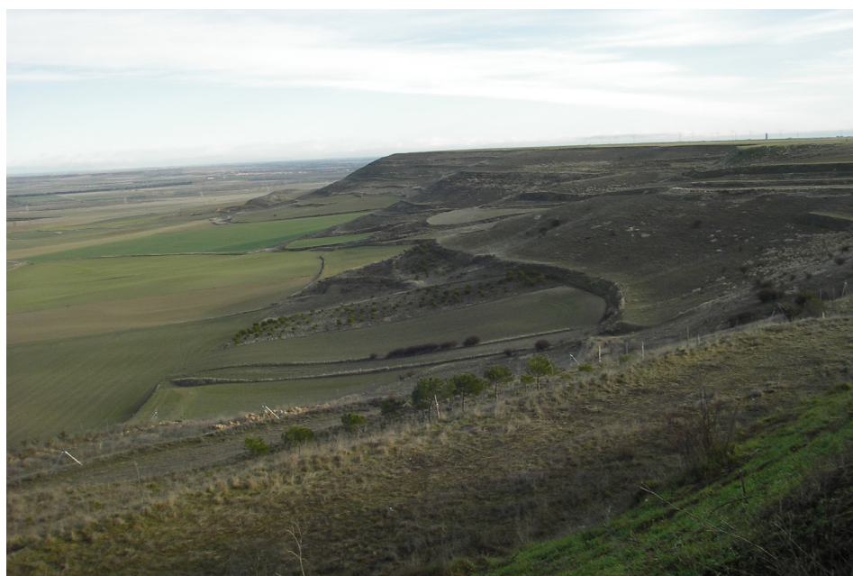
Figure 3. Countryside with cereal crops and vegetation of the «Iberian steppe» type (Tierra de Campos, Province of Palencia, Spain)

original, natural characteristic is surrounded by controversy because of the decisive human intervention involved in its genesis (Figure 3). In short, the «Iberian steppes» could have a clear definition as a cultural landscape; something which must currently be left to future research to decide. Nevertheless, it can be stated that, as enclaves within typical «steppe» landscapes, even today they are still changing traditional agricultural landscapes with lagoons and wetlands, into new, officially protected environments, and thus they are transformed into «a reality of singular eco-cultural characteristics» (Naranjo et al., 2016: 441).