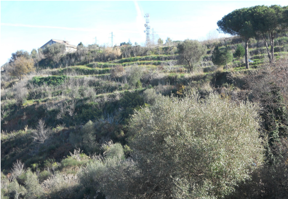
Figure 1. Olive trees and stone pines in a humanised landscape in the South of Italy (Vibo Valentia, region of Calabria)

On the other hand, and secondly, Physical Geography's fragmentation and lack of relevance is due to the fact that geographers of the physical environment, and most other naturalists, have underestimated the enormous importance of the diachrony of human intervention on the physical environment in the form of natural landscapes. Only a few naturalists have admitted this in the academic university sphere in Spain. Such is the case of F. González Bernáldez, who stated that «a very large proportion of the «natural» landscape is the product of the interaction between man and nature» (González, 1985: 153). He even pointed out that, in the Iberian Mediterranean sphere, this fact is very pronounced and ostensible: «for instance, the Iberian Peninsula is a highly adequate stage on which to view the conversion of Mediterranean woodland to orchards» (González, 1985: 152). He also added that this action has been especially intense in the case of the olive groves in Southern Europe (Figure 1).